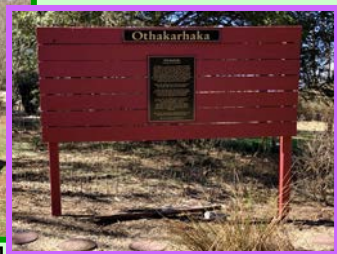
Water feature sign

"April showers bring May flowers". Yes, it's that time of year when I send a plea for three people to do weekly watering of the potted flowers that brighten the crescent garden area. It takes about 45 minutes, but it's time well spent in the outdoors and nurturing flowers. We need waterers for Mondays, Wednesdays, and Fridays. Choose the day that best suits your schedule and email me, Susan , with your availability. We'll cover for you when you are away. Watering starts in May and usually ends in late September. We'll provide training; you aim the hose.