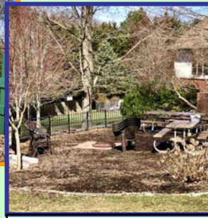
Lower picnic area