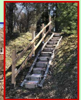
Steps & handrail to upper lawn