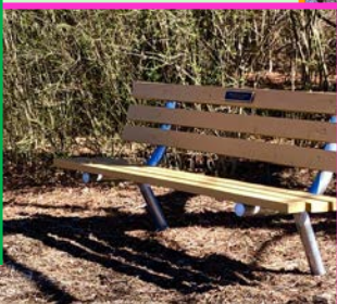
7 meditation benches