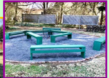
Upper picnic area