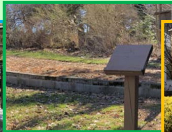
Cinder block retaining wall