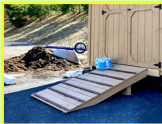
Ramp to shed