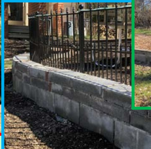
Block wall to level picnic area