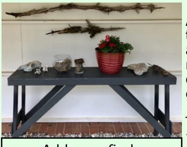
Add your finds to the table

A new addition is a "Nature Speaks" table located near our side entrance. Items on the table have been found on our grounds with the exception of two rocks that have aquatic fossils on them and came from a farm about 20 miles away. Dislodged birds' nests, animal skeletal bones and interesting pieces of wood are currently displayed. We encourage you to add interesting items you find when enjoying our grounds.