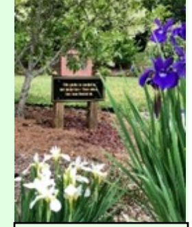
Entrance to Memorial Garden