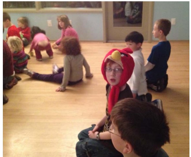
Enjoying the Angry Birds KidSpirit Party.