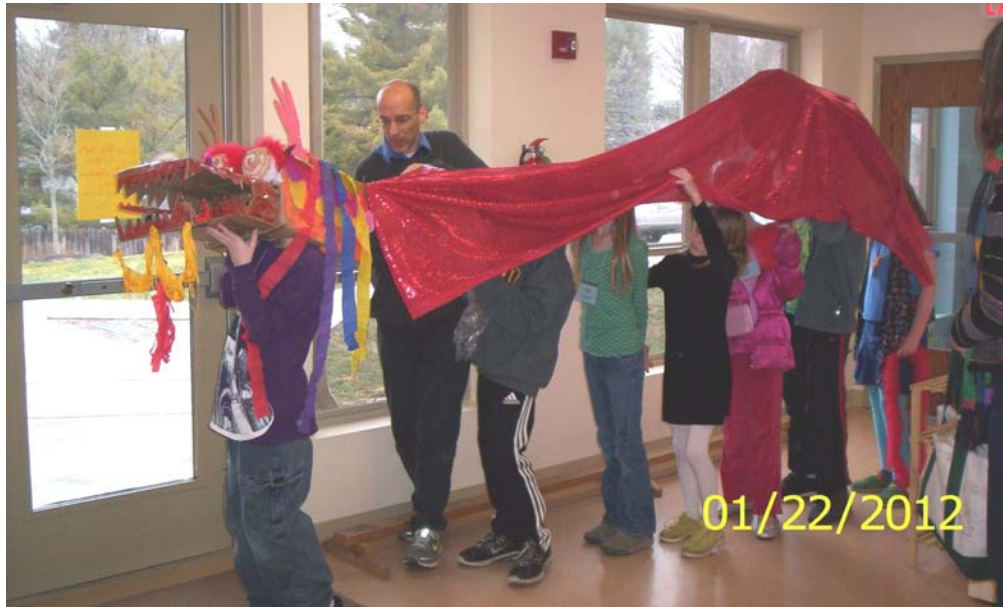
The grade 4-5 RE class celebrates the Chinese New Year as part of their Holidays and Holy Days curriculum by parading a dragon through Elarth Hall following the service.