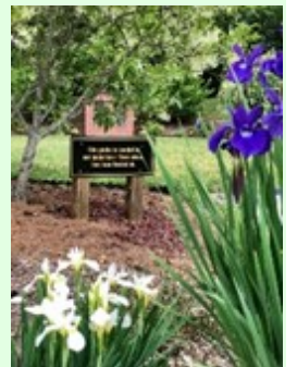
Entrance to Memorial Garden

I admit it – I'm a trespasser. When I'm on UUC's grounds, I am "trespassing" into the domain of a variety of wildlife. We have baby groundhogs who play in the peacock meadow which are cute, regardless of one's feelings about them. There are rabbits, squirrels moving about, birds feeding their newborns or looking for a lover, butterflies flying from flower to flower, ants building their expansive communities, and bees moving to and from the 3 hives. Sometimes I feel like an interloper spying on the activities of wildlife but also realize I am part of this web of life and am fortunate to be one of the caretakers. Life as we knew it may have ground to a halt, but not so with the activity on our grounds. We welcome you to come and explore, relax, and refresh.