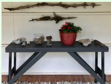
Add your finds to the table

A new addition is a "Nature Speaks" table located near our side entrance. Items on the table have been found on our grounds with the exception of two rocks that have aquatic fossils on them and came from a farm about 20 miles away. Dislodged birds' nests, animal skeletal bones and interesting pieces of wood are currently displayed. We encourage you to add interesting items you find when enjoying our grounds.