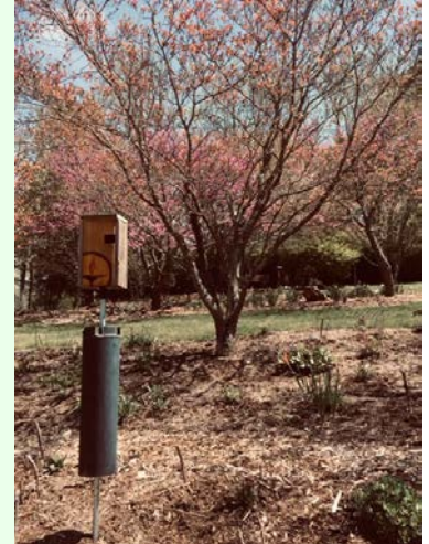
Spring blossoms provide a colorful landscape (and the bees love the blossoms)

UUC's grounds are one of 7 gardens on the Friends of the Library Garden Tour , Saturday, July 6 , 9-5. This annual tour raises money for enrichment programs at the Montgomery Floyd Regional Library. We are expecting 400-800 ticket-holders to visit our grounds. It is exciting but also a bit intimidating/terrifying. In preparation, we will hold a work day on Saturday, June 29 , 10 AM-noon and hope many of you will help with fine-tuning the grounds in preparation for the tour. PLEASE put the workday and the tour on your schedule. More information will be forthcoming.