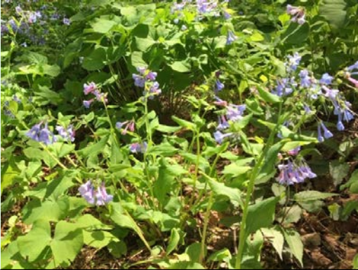
Bluebells blooming in Gloria Heath's wildflower area

Spring is a magical time of year on UUC's grounds. The color palette is impressive, the birds are building nests and chatting away in "bird talk", and each day brings new surprises of plants popping through the soil. There are numerous meditation spots on our grounds waiting for people to enjoy them. Take a walk!